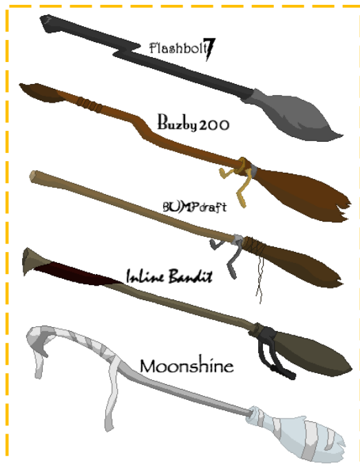
Examples of racing broomsticks

Design and create your own racing broomstick for our Hogwarts History of Sports festival and you could win a Harry Potter themed prize!