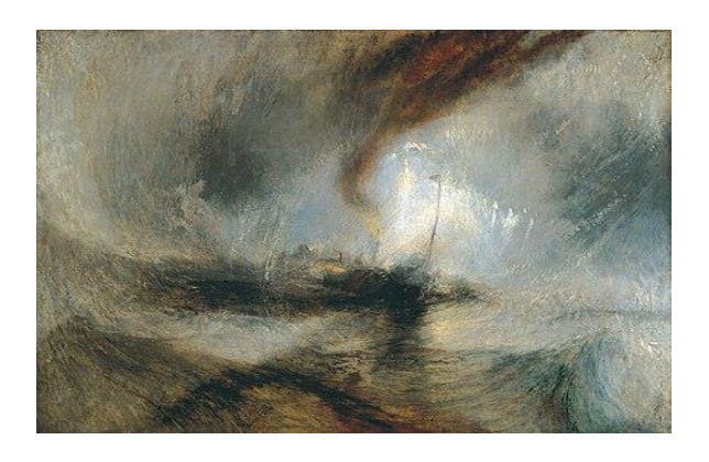
Snow Storm by J.M.W Turner

Lesson part 2: Following on from this your child/children can paint/draw a seasonal weather picture of their own in a style that both shows the weather conditions and also creates a 'feeling' of what the weather is like for people in the painting. For example, a picture of a winter snow scene might include a person or animal bent over trying to struggle through a blizzard.