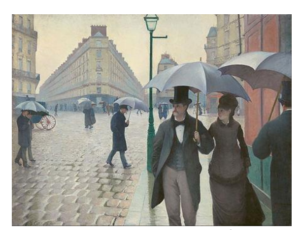
Paris street; Rainy Day by Gustave Caillebotte